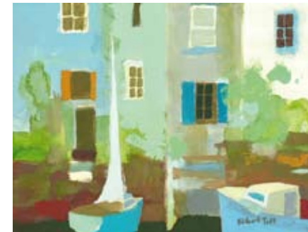
"Water Front" by Richard Tuff 170mm x 220mm, gouache on paper, £350