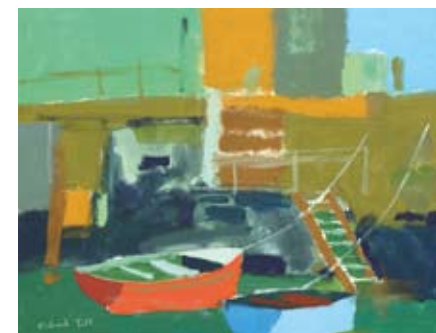
"Two Boats" by Richard Tuff 170mm x 215mm, gouache on paper, £350