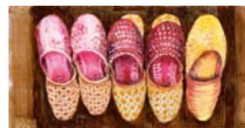
"Slippers" by Sarah Wimperis 65mm x 130mm, watercolour on ivory, £150