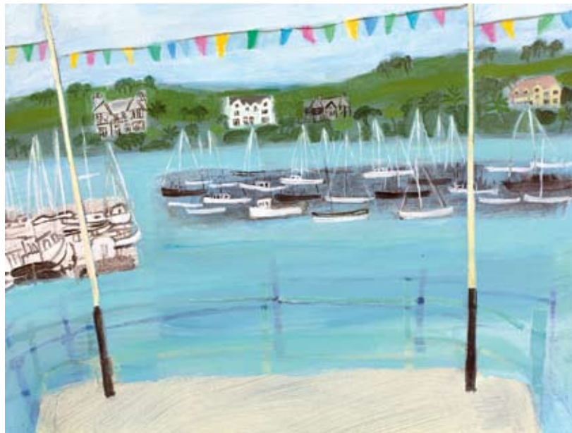
"Falmouth, Boats and Grand Houses" by Emma Jeffryes 510mm x 670mm, acrylic on paper, £950