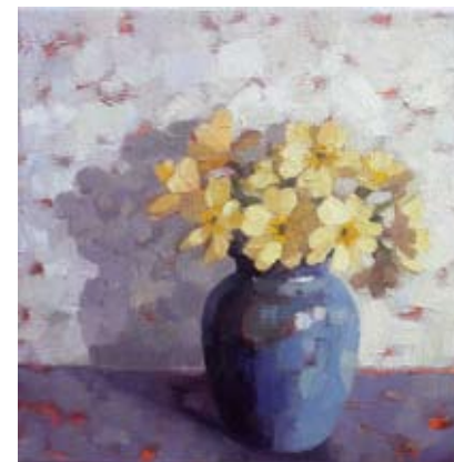
"Primroses" by Anne-Marie Butlin 200mm x 200mm, oil on canvas, £395