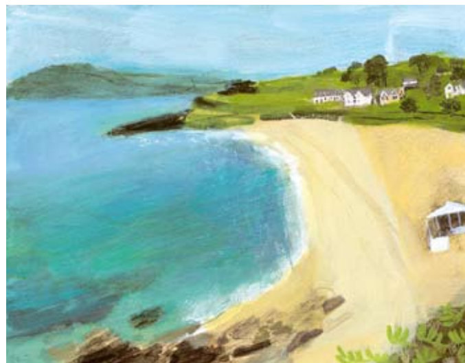
"Gylly Beach" by Emma Jeffryes 335mm x 430mm, acrylic on paper, £550