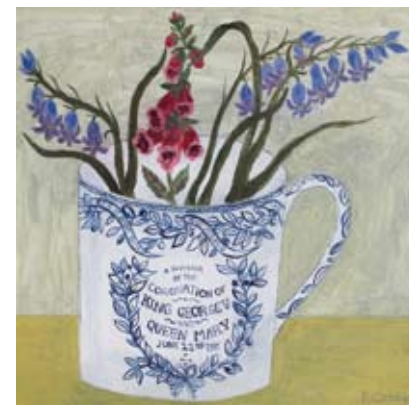
"Coronation Cup and Foxglove" by Debbie George 200mm x 200mm, acrylic on board, £350