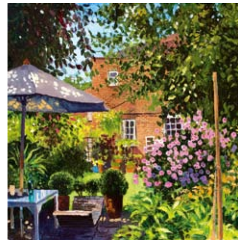
"Wine in the Garden" by Sarah Wimperis 370mm x 360mm, oil on board, £475