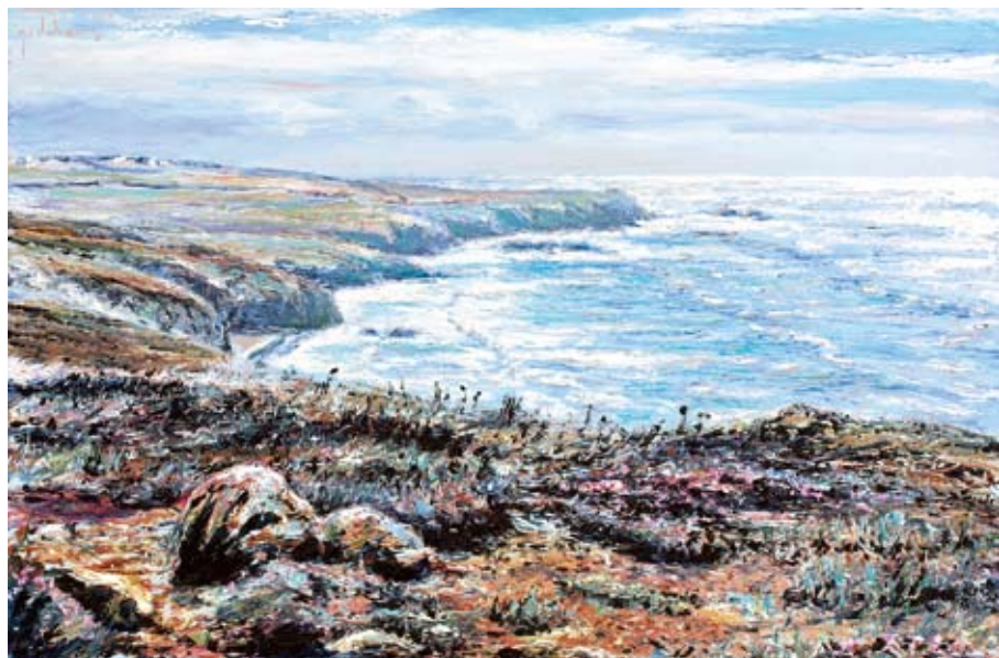
"Pentreath" by Andrew Giddens 500mm x 760mm, oil on canvas, £1195