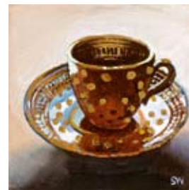
"Gold Spot" by Sarah Wimperis 85mm x 85mm, oil on board, £150