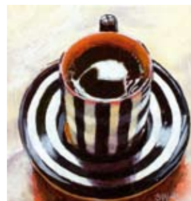
"Striped Cup" by Sarah Wimperis 95mm x 95mm, oil on board, £150