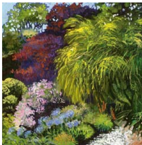
"Trebah Path" by Sarah Wimperis 360mm x 365mm, oil on board, £475