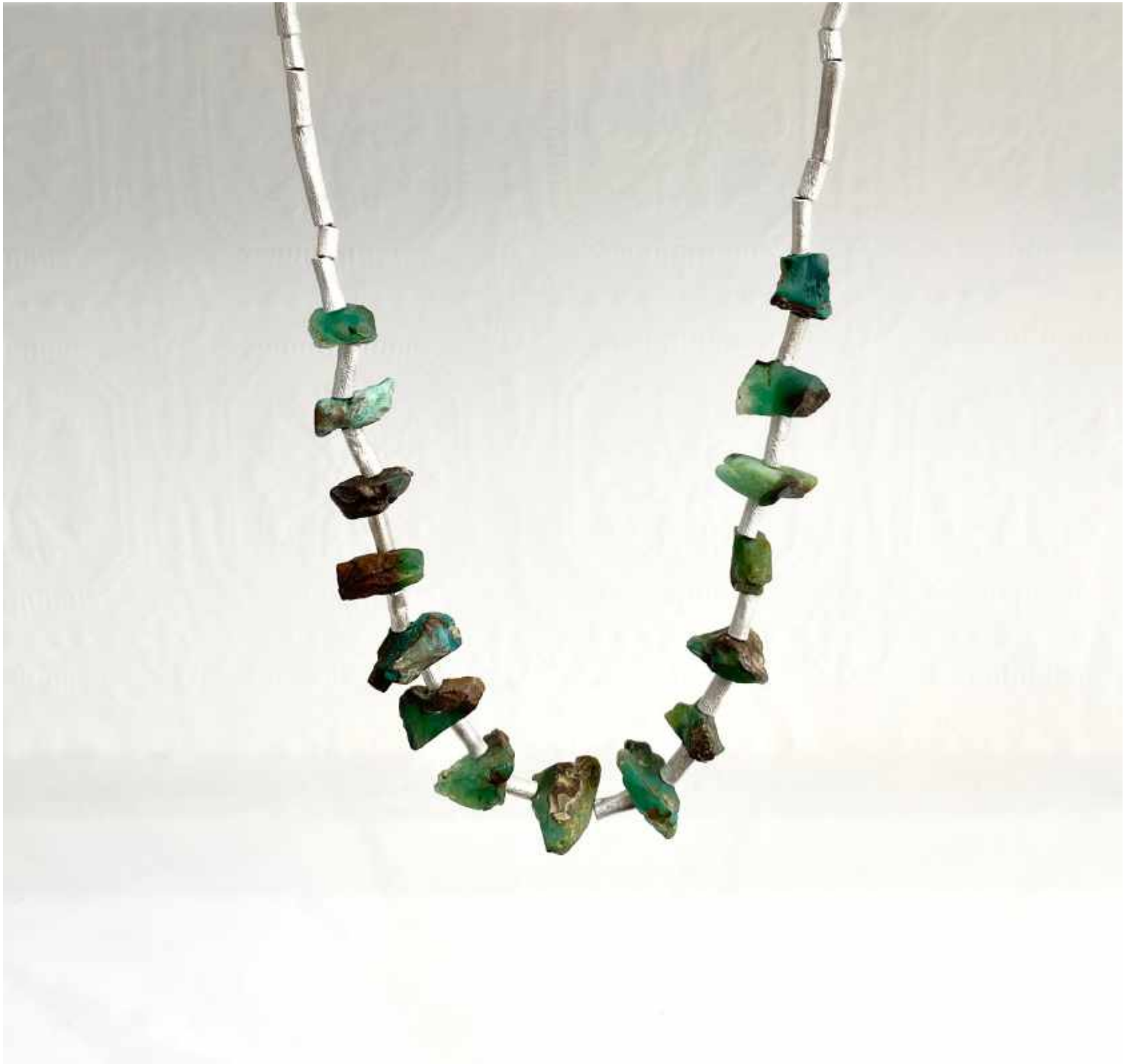
Large Eroded Silver Tubes with Chrysocolla Chips by Roberta Hopkins £340