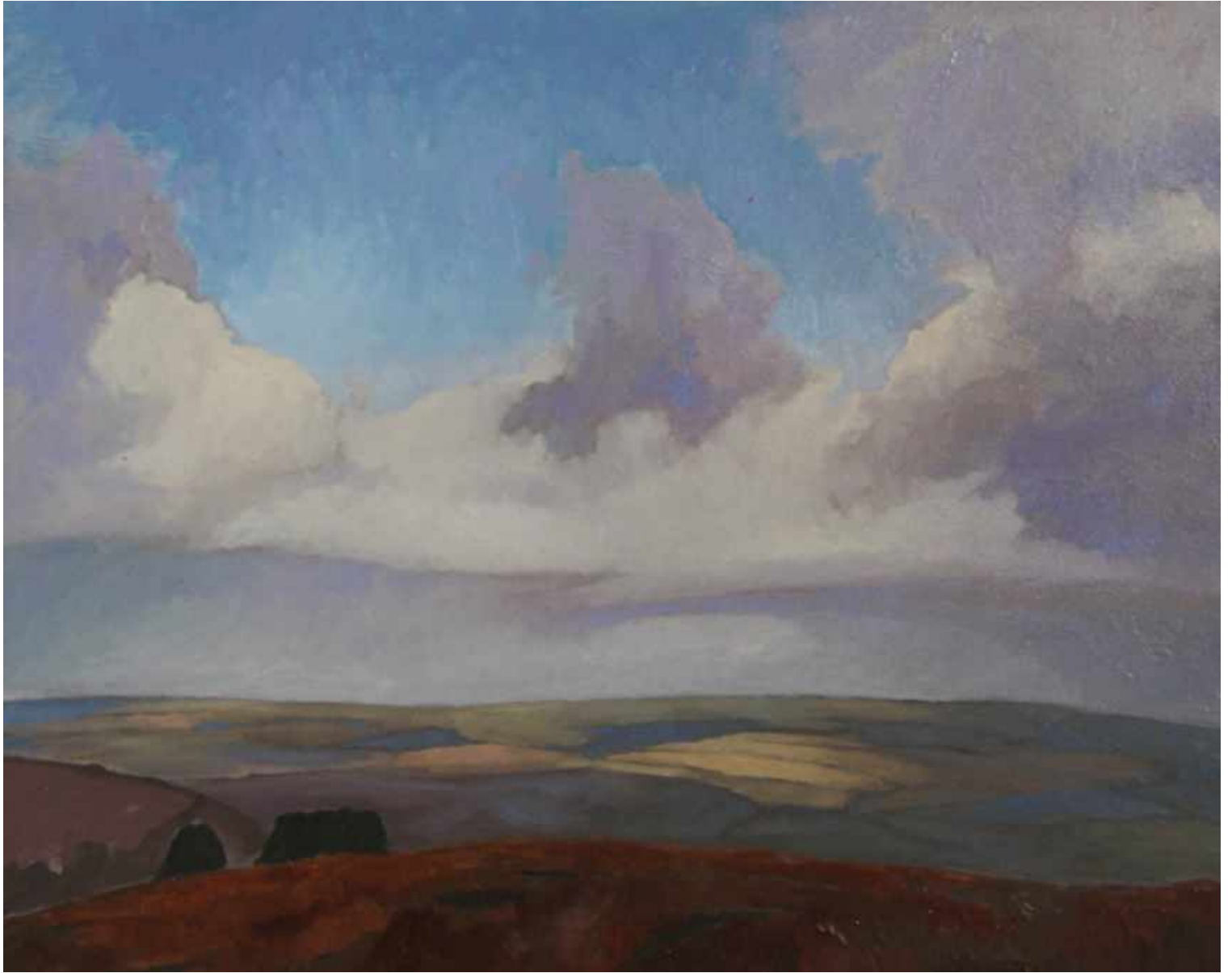
SUN THROUGH THE CLOUDS, ROSEWALL HILL