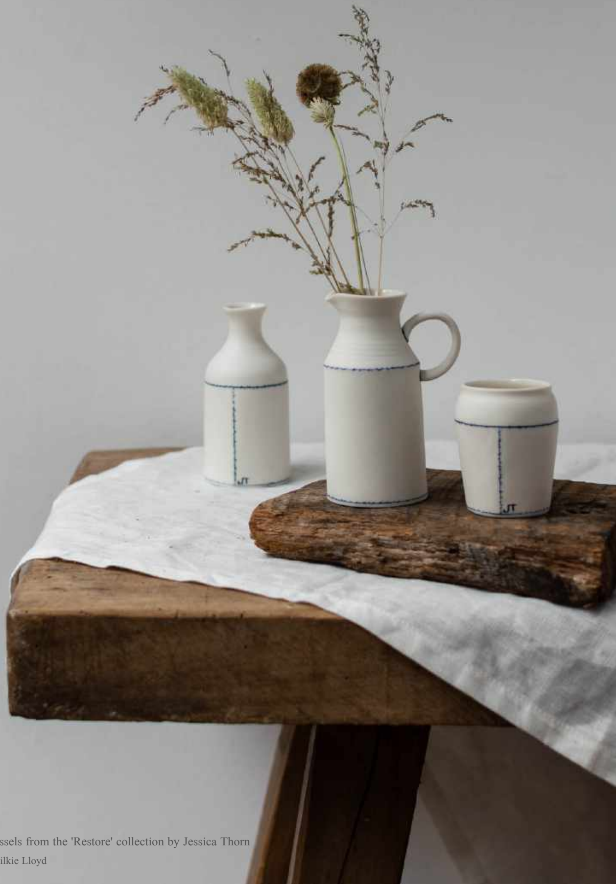
Porcelain vessels from the 'Restore' collection by Jessica Thorn