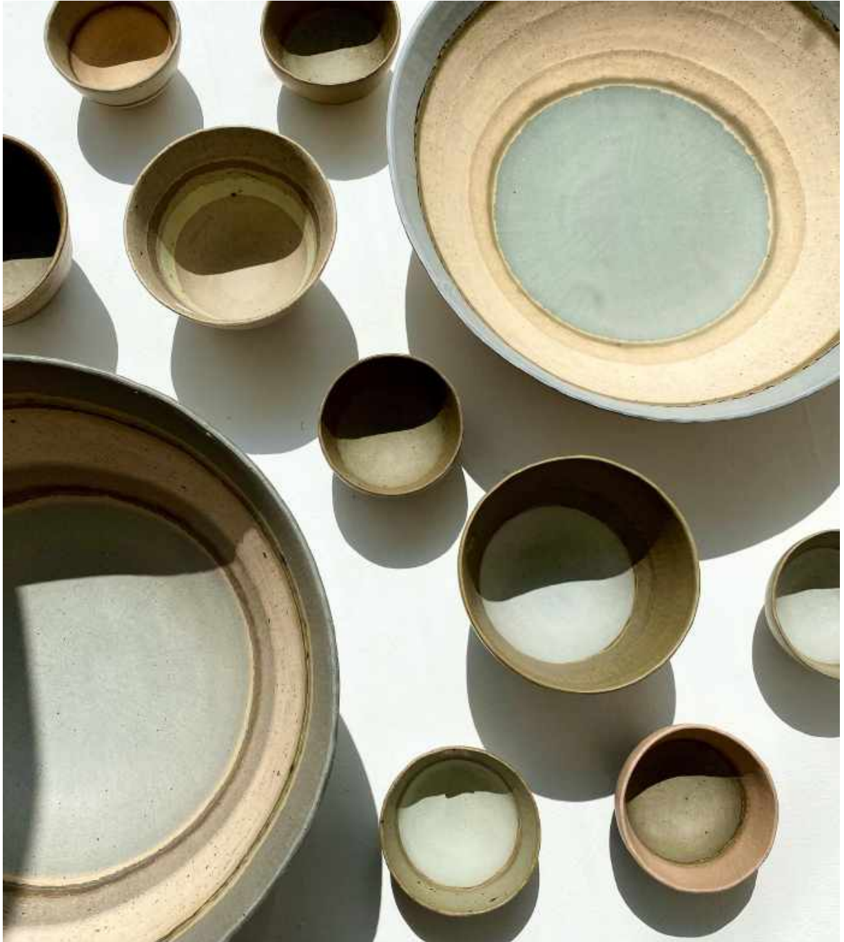
Coiled and hand built pots by Charlotte Jones, £45 - £480