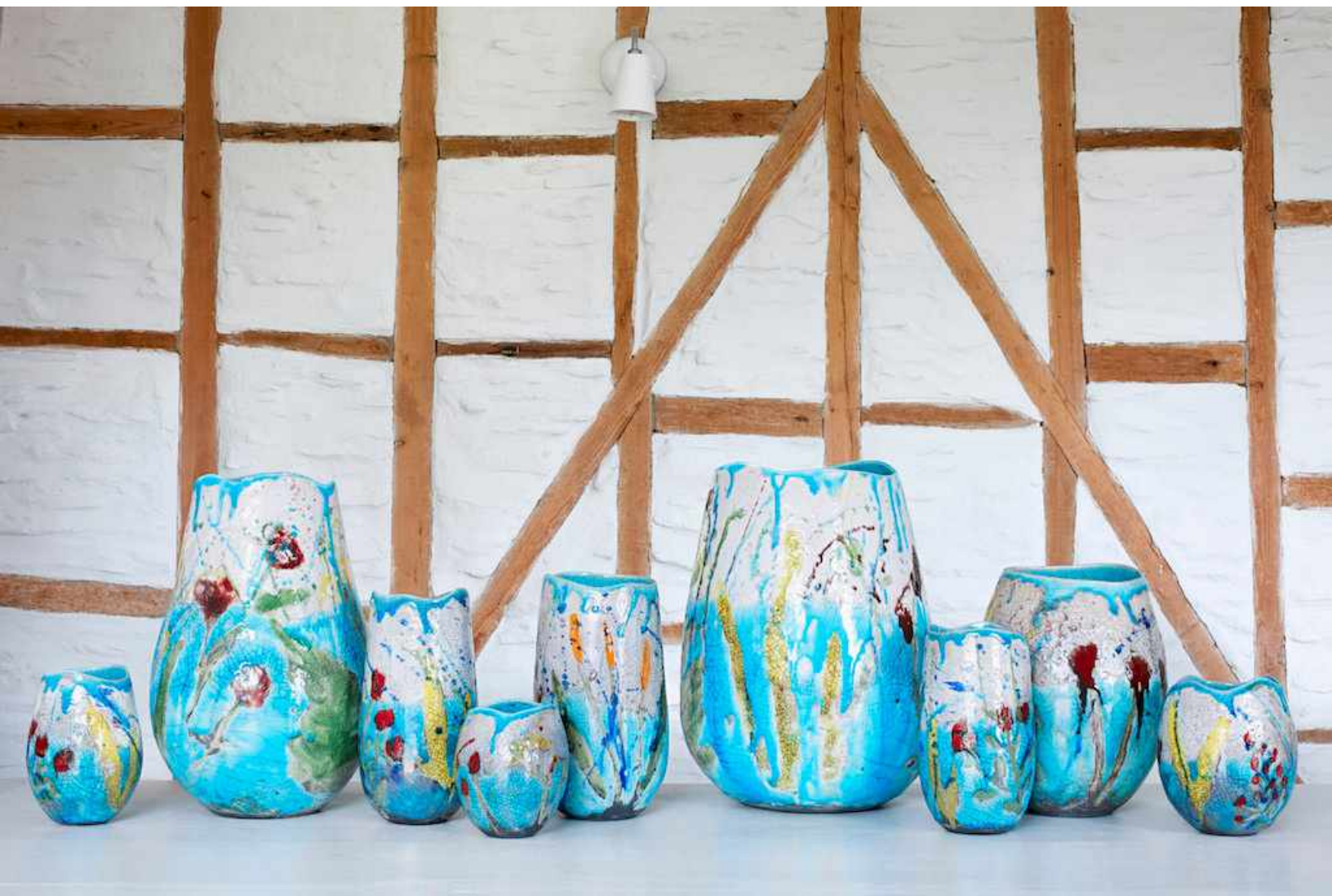
Wild Cornwall Pots, raku fired ceramics by Catherine Lucktaylor, £95 - £495