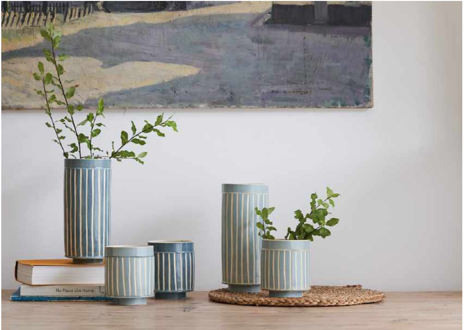
Hand built ceramics by Emily-Kriste Wilcox, £80 - £350