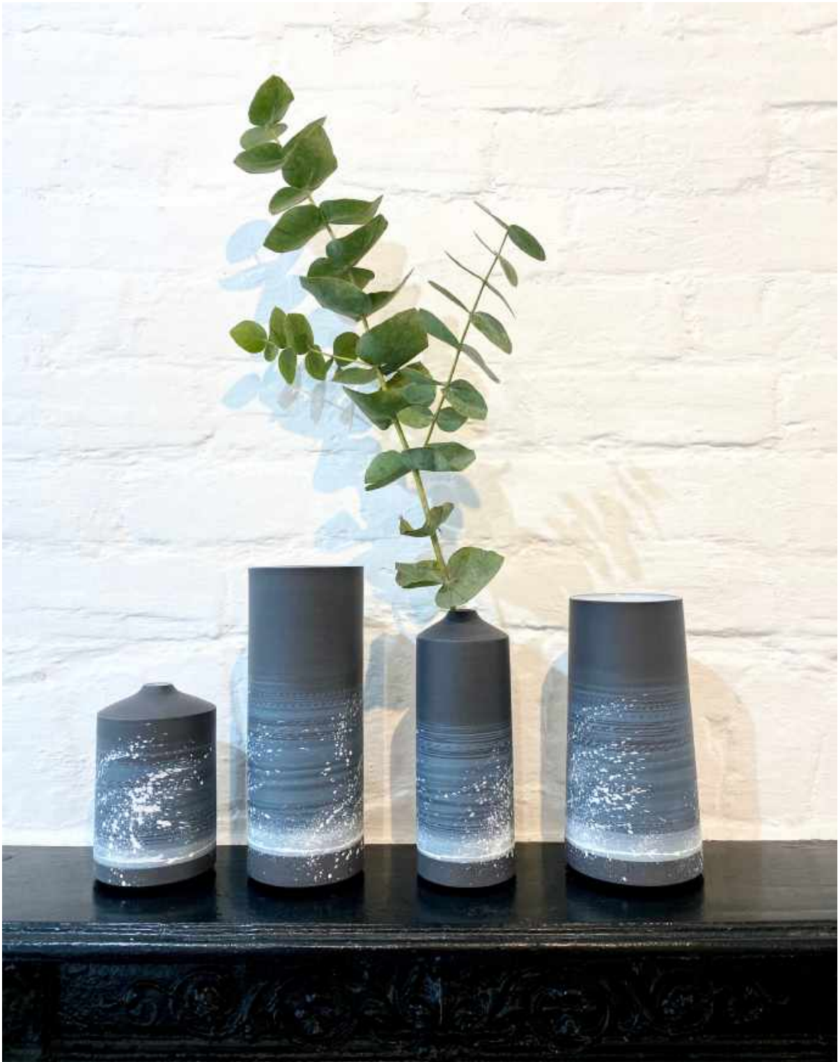
Black porcelain ceramics by Steve Smith, prices range from £38 - £54