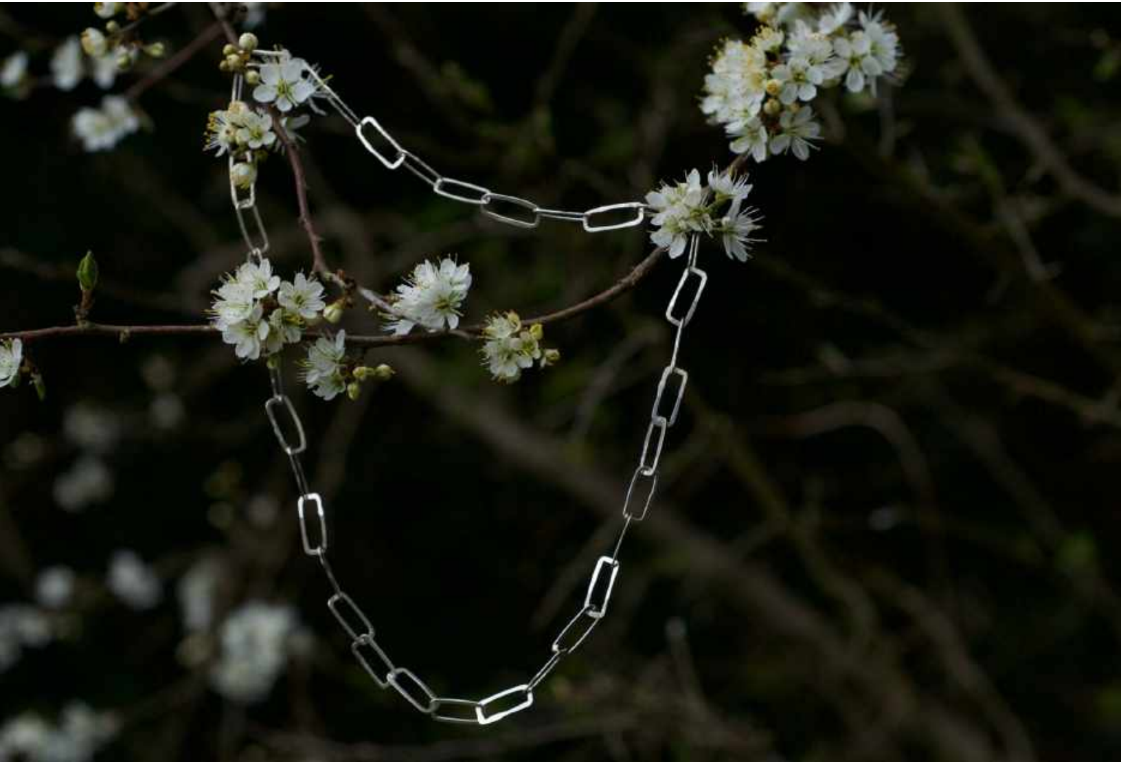
Mini Monolith Chain Necklace by Lucy Spink, £200