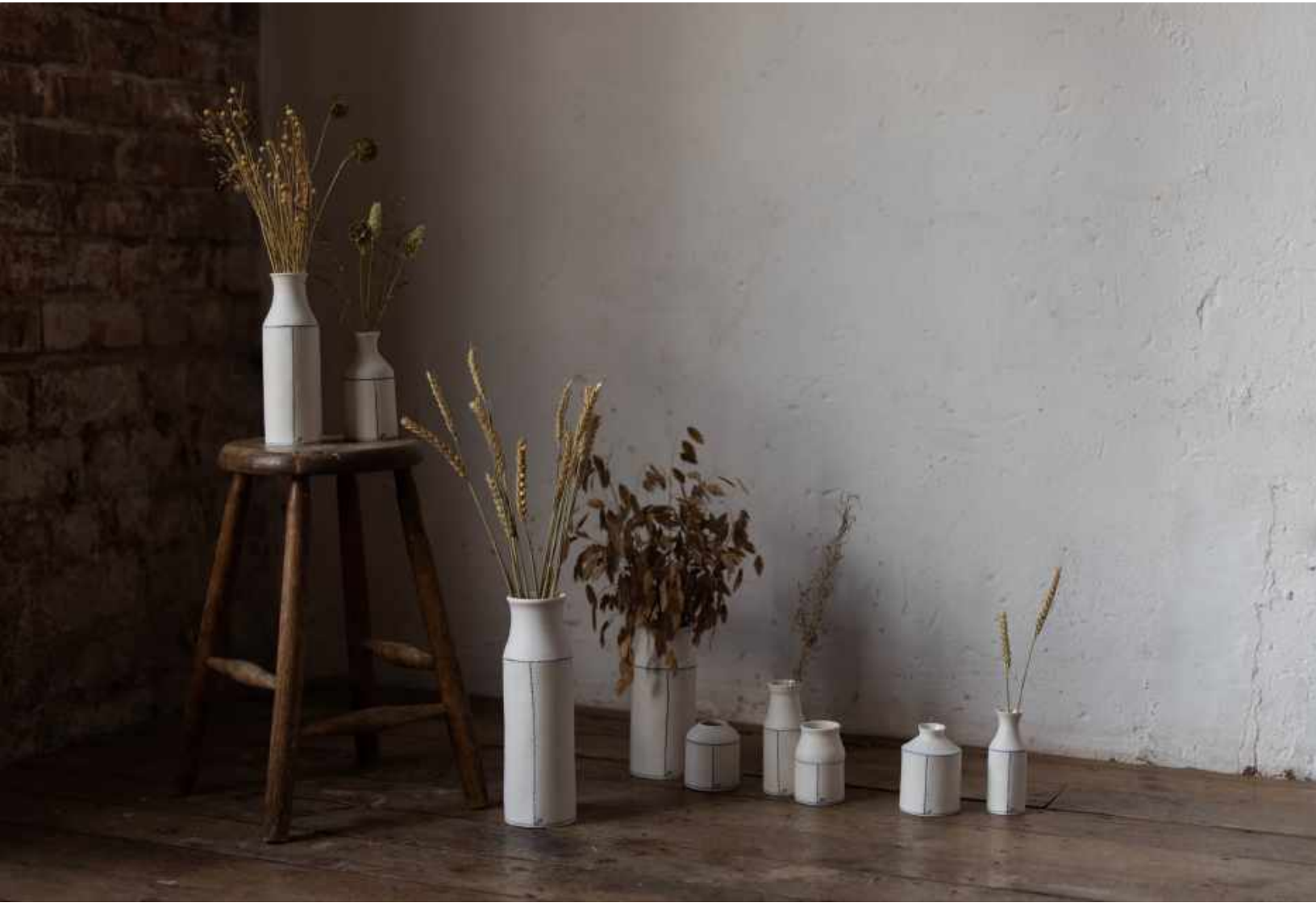
Porcelain vessels from the 'Restore' collection by Jessica Thorn