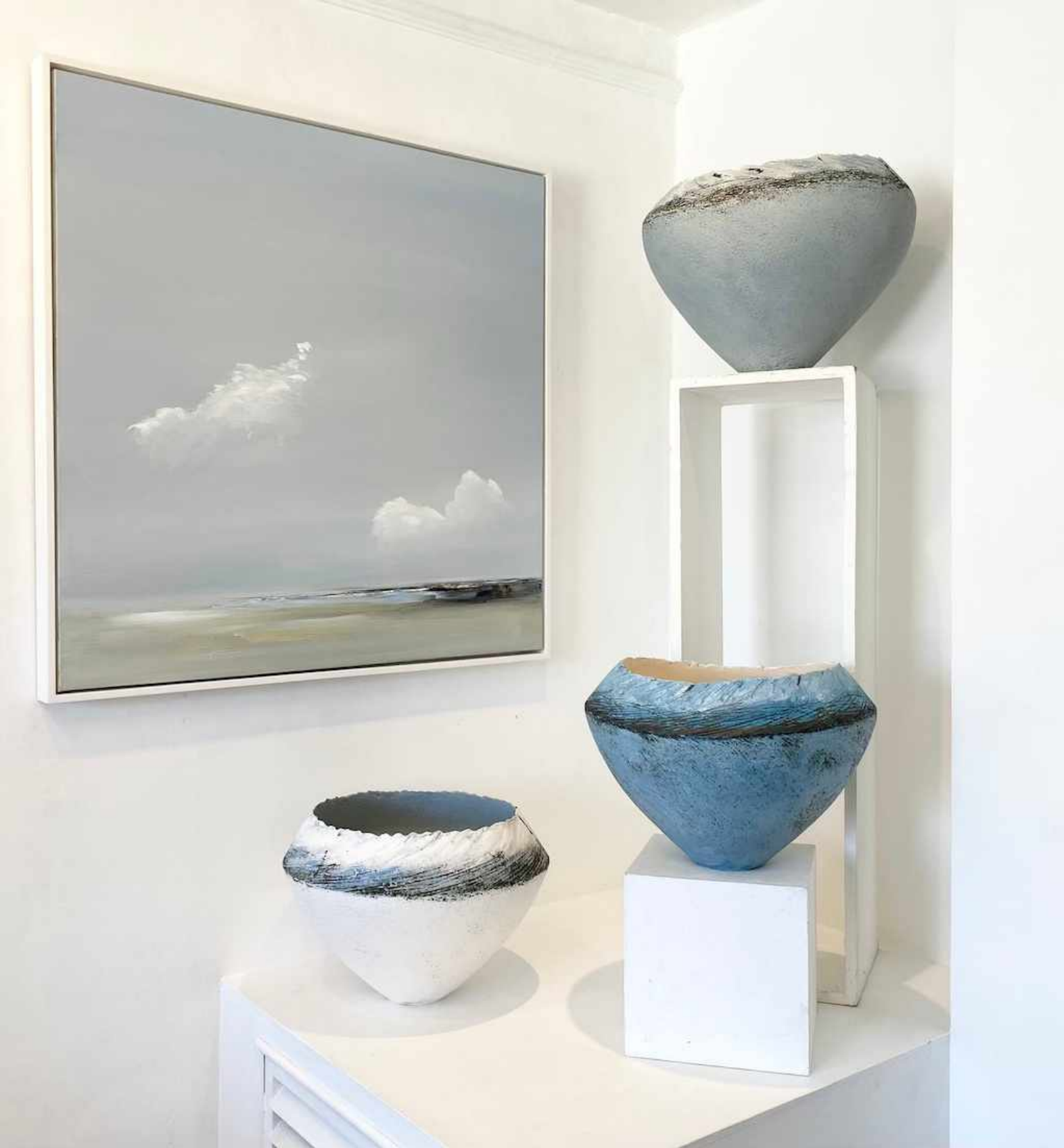
Summer Bright by Nicola Mosley, oil on canvas, 91 x 91 cm, £1,895