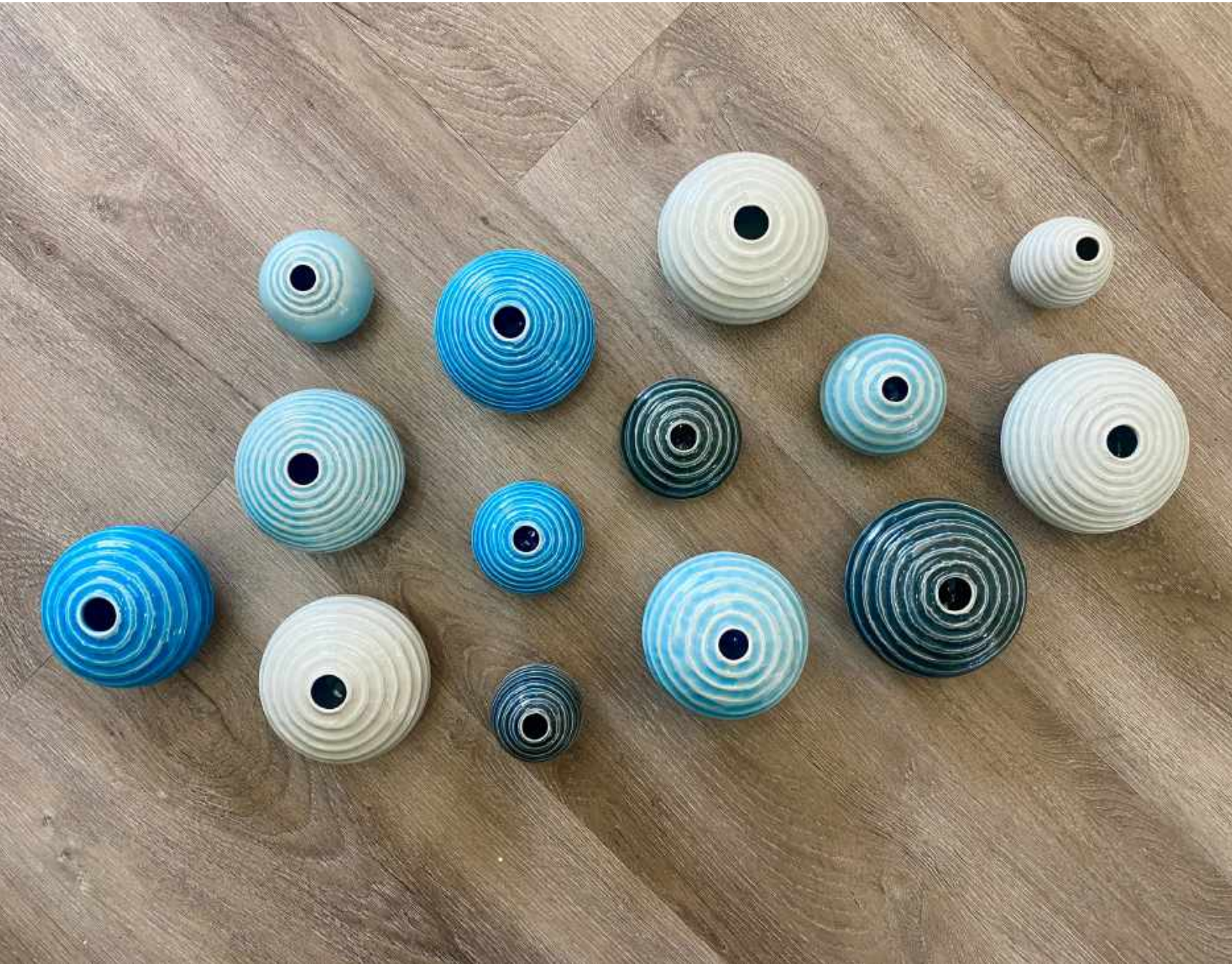
Ceramic Pots by Vanessa Bullick, £22 - £35