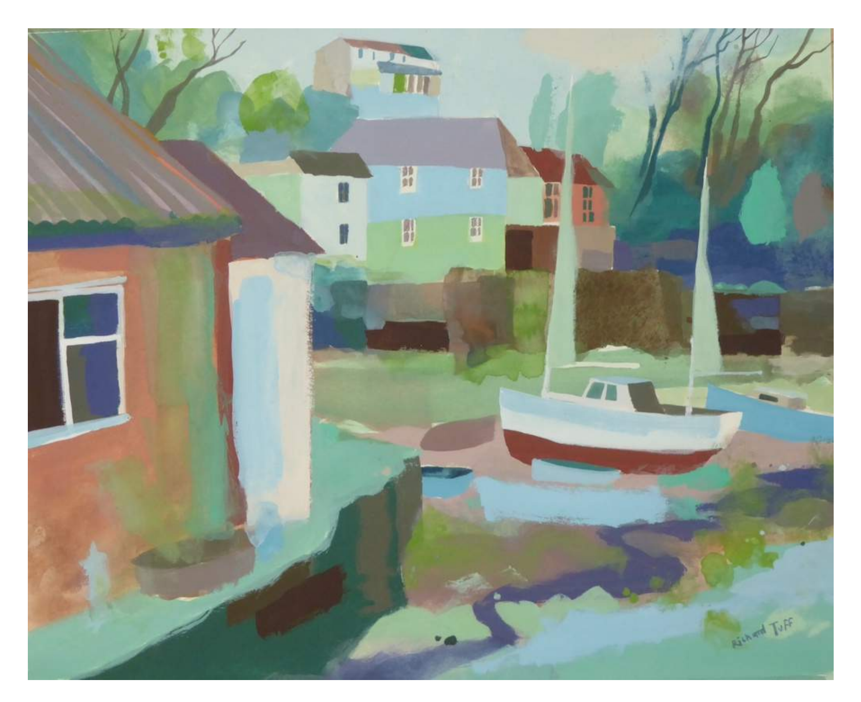
Boats at Port Navas, 37 x 47 cm, gouache on paper, £1,250