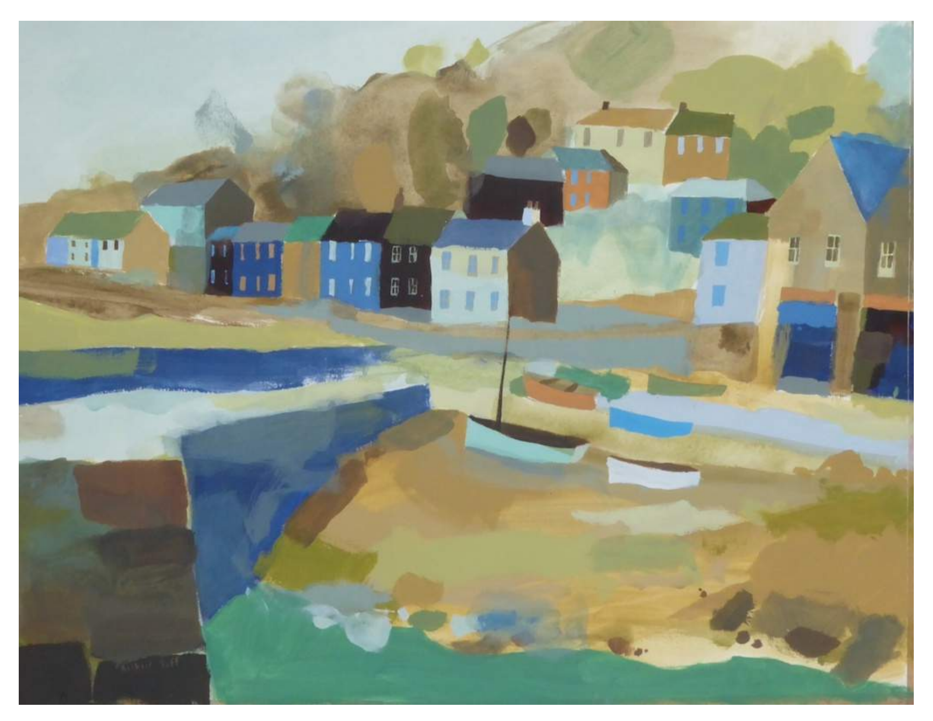
Across the Harbour, Mousehole, 45 \times 65 cm, gouache on paper, £1,450