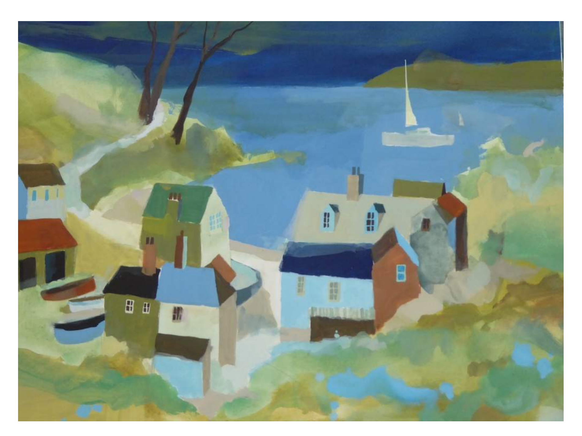
View out over Durgan, 42 \times 55 cm, gouache on paper, £1,450