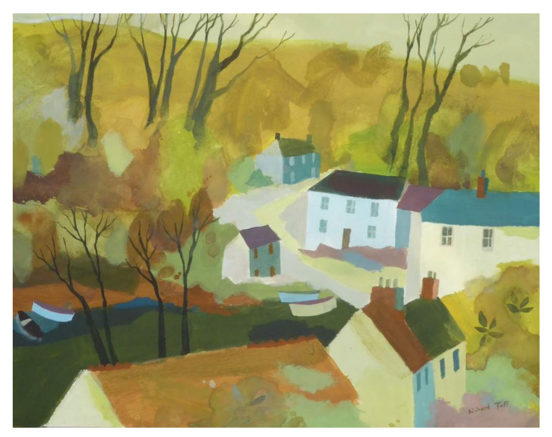
Port Navas, Head of the Creek, 37 \times 47 cm, gouache on paper, £1,250