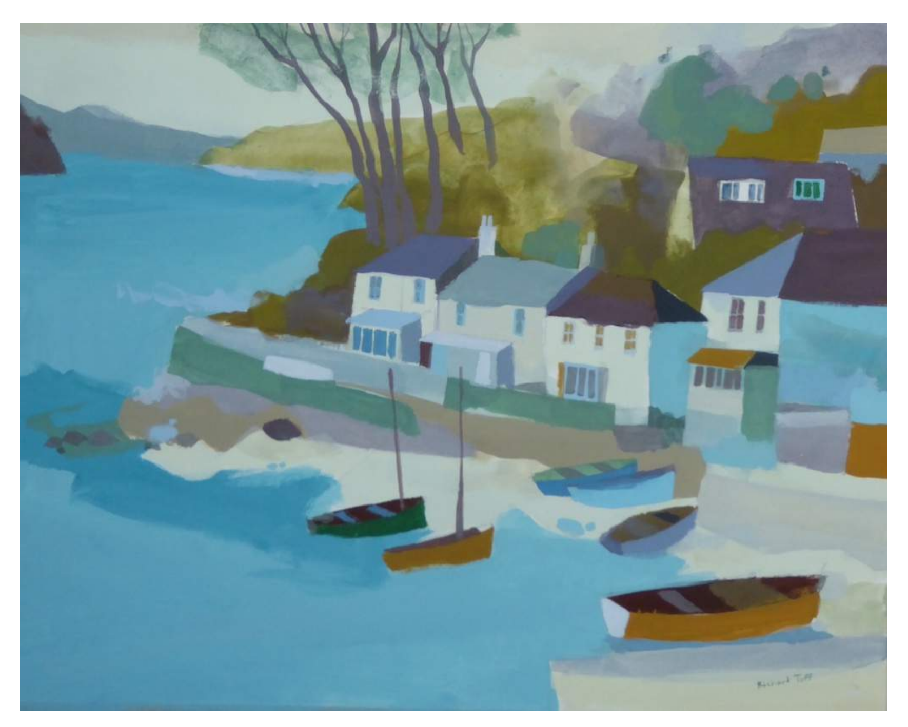
Morning Walk, Helford Passage, 37 \times 47 cm, gouache on paper, £1,250