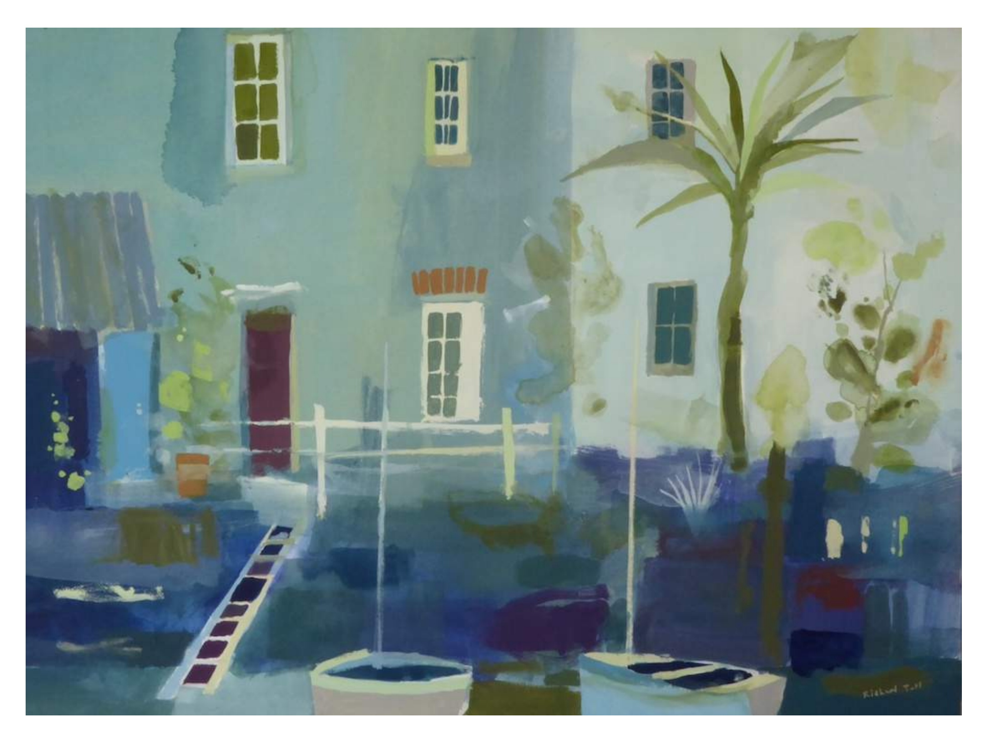
Fowey Riverfront, 45 \times 65 cm, gouache on paper, £1,950