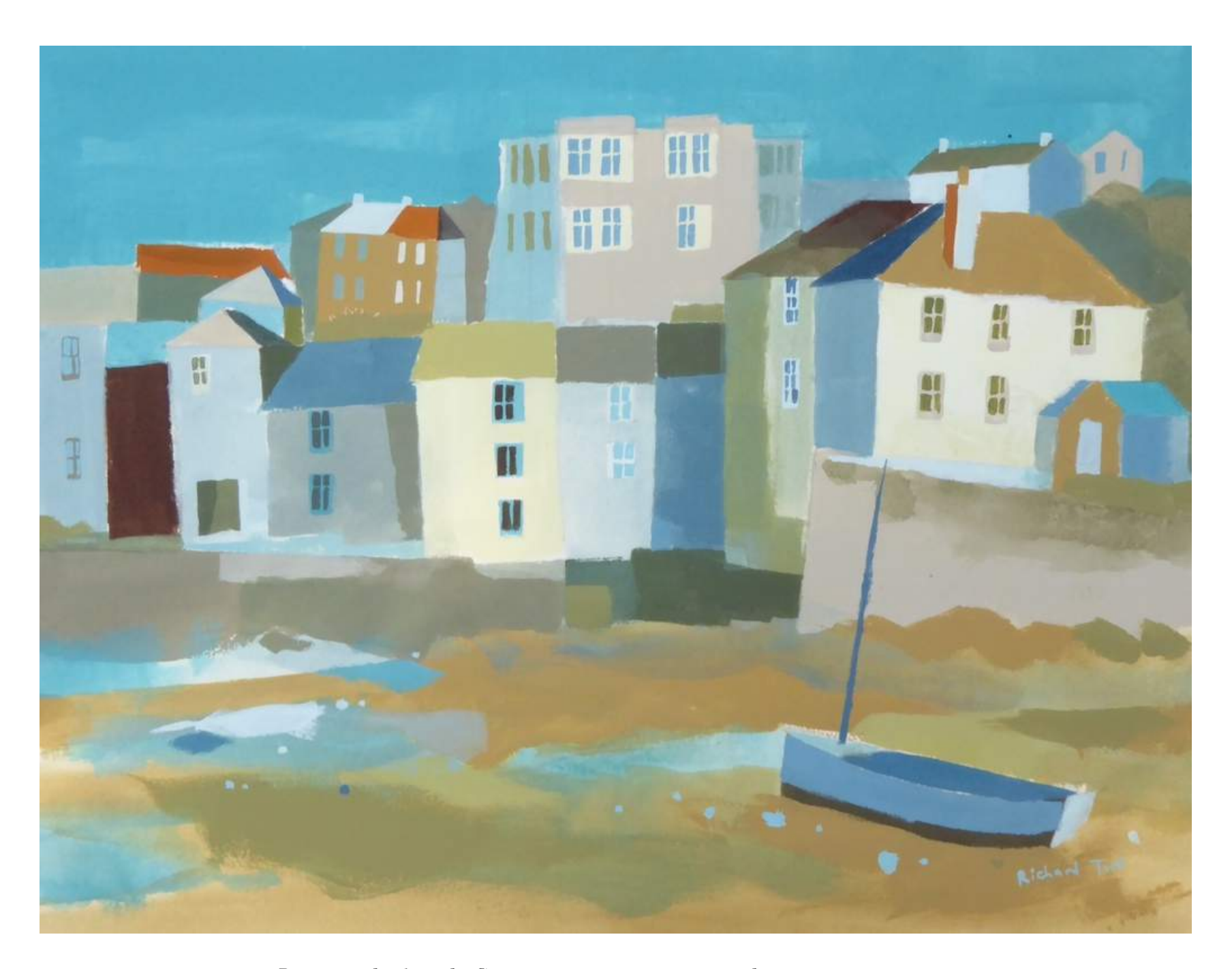
Boat on the beach, St. Ives, 33 \times 43 cm, gouache on paper, £1,050