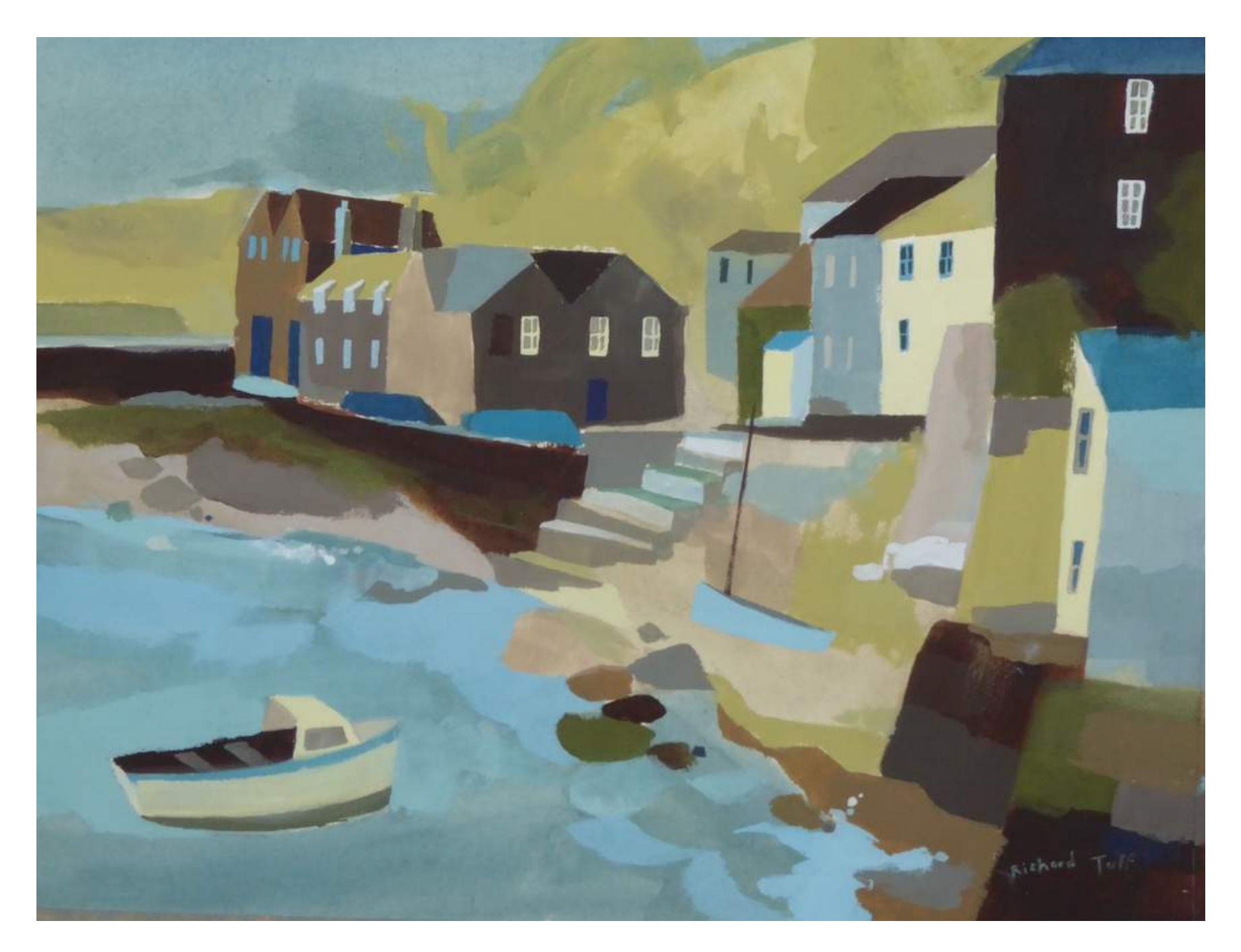
Mousehole Afternoon, 33 x 43 cm, gouache on paper, £1,050